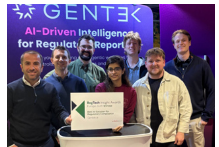
The Gentek.ai Team celebrates their award