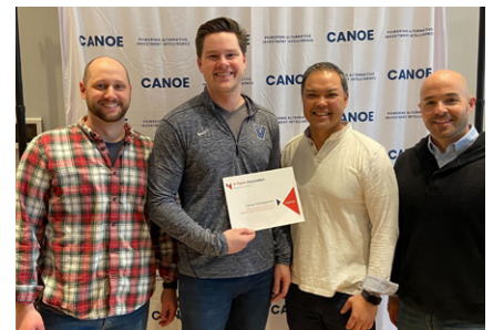
Canoe's Product Team