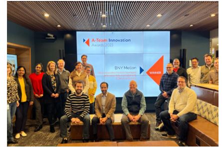
Team Data Vault, BNY's Integrated Data Platform