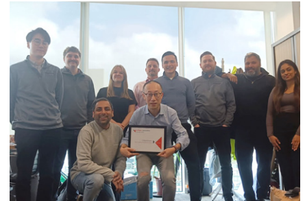
Members of FXSpotStream's EMEA Team