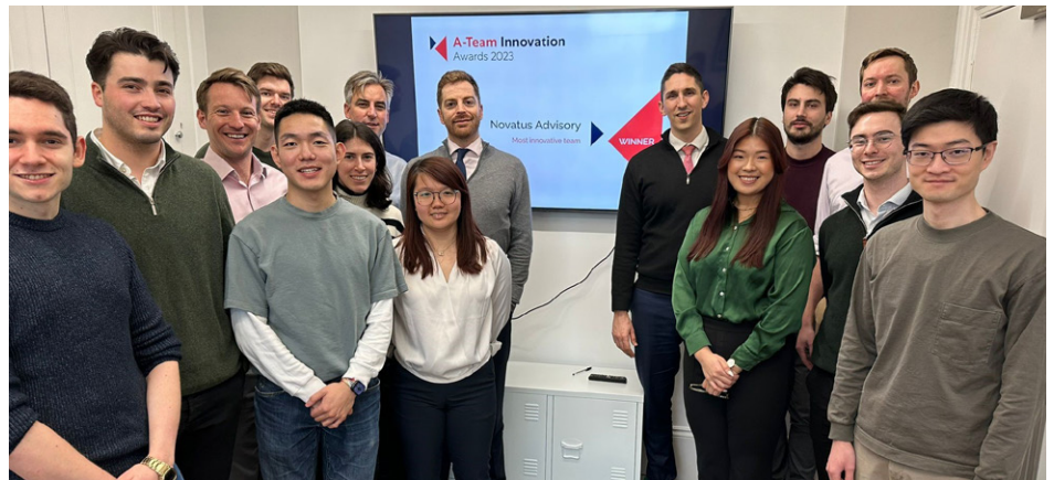
Members of the Novatus Advisory and RegTech teams

We are currently developing other RegTech products for compliance, risk and ESG. Our next product - the Novatus Compliance Management Tool ("CMT") will be launched in April 2023. This streamlines and digitises compliance for firms, thus significantly reducing the risk of non-compliance with regulations and cost.