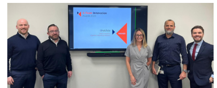
The team from UnaVista, An LSEG Business, celebrating their award win