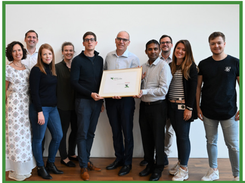
The EasyTax team at Regnology

By using EasyTax, financial institutions can support their clients without the need to grow and maintain in-house tax expertise. EasyTax for example calculates account balances, income amounts, taxable capital gains and highlights deductible amounts and expenses and makes clients aware of reclaimable tax credits. Over 90 financial institutions already provide their clients with high-quality tax reports in more than 35 countries worldwide!